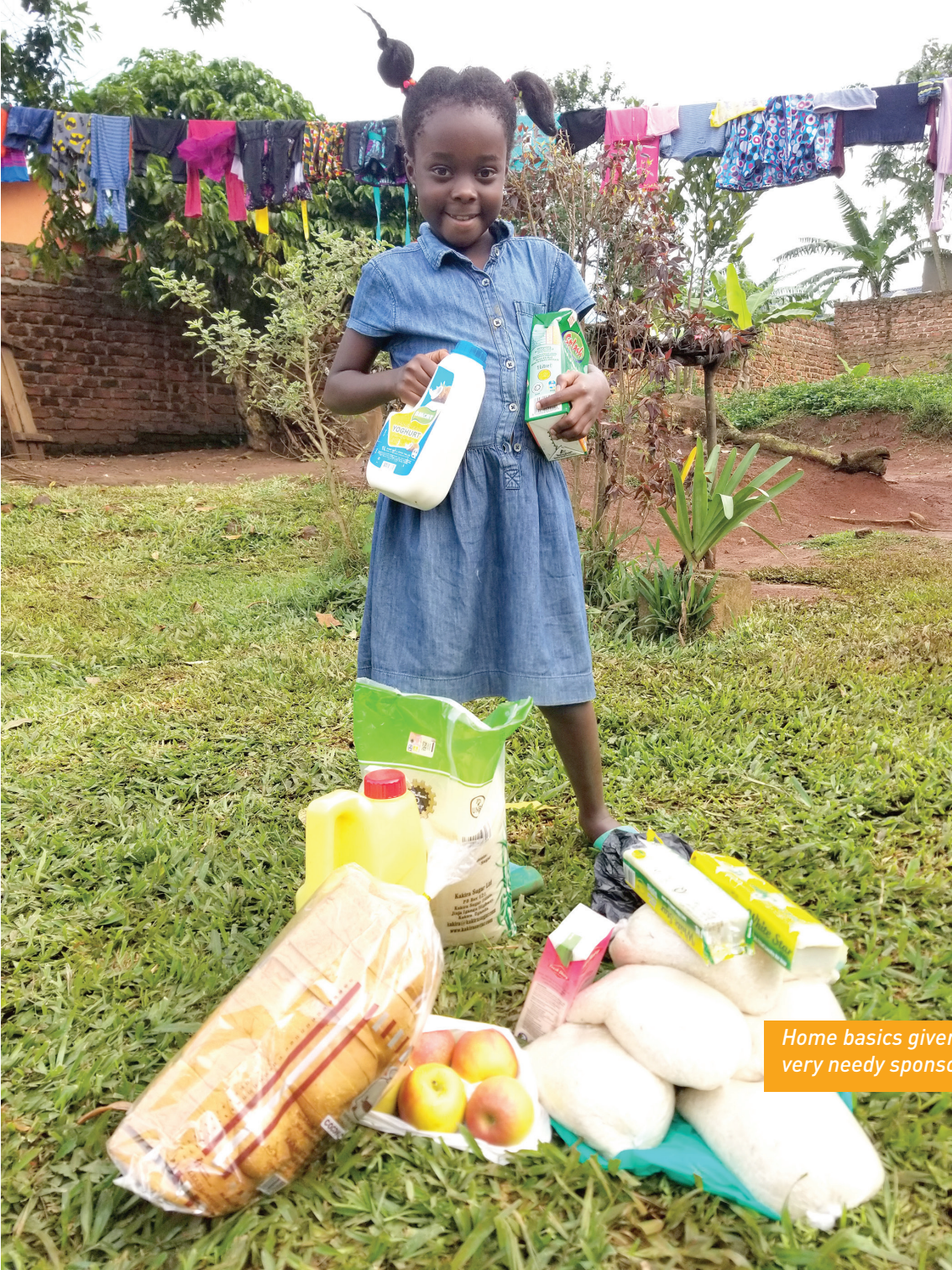
Home basics given out to one of our very needy sponsored kids.