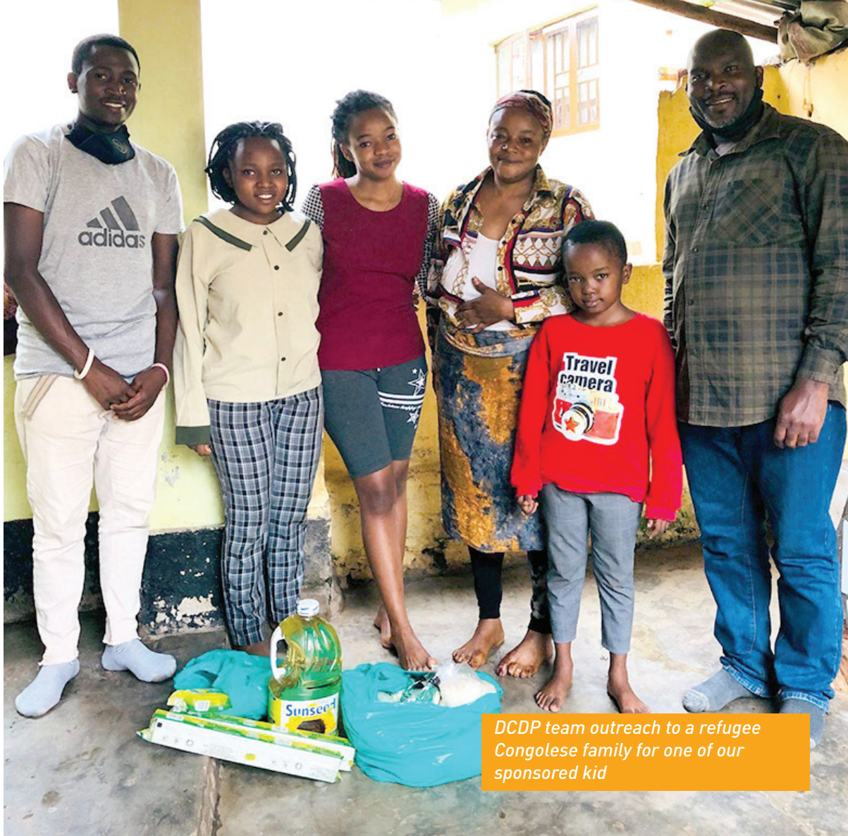
DCDP team outreach to a refugee Congolese family for one of our sponsored kid

b. The Emergency Relief Program was started to support the low income, jobless one-meal-a-day families, especially in times of emergencies. This ranges from supporting individuals/families with basic needs like soap, sugar, corn flour, frying oil, etc.