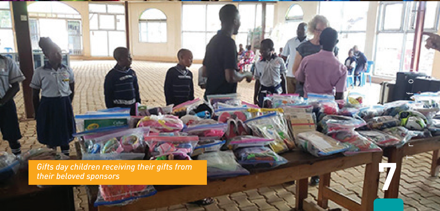
Gifts day children receiving their gifts from their beloved sponsors