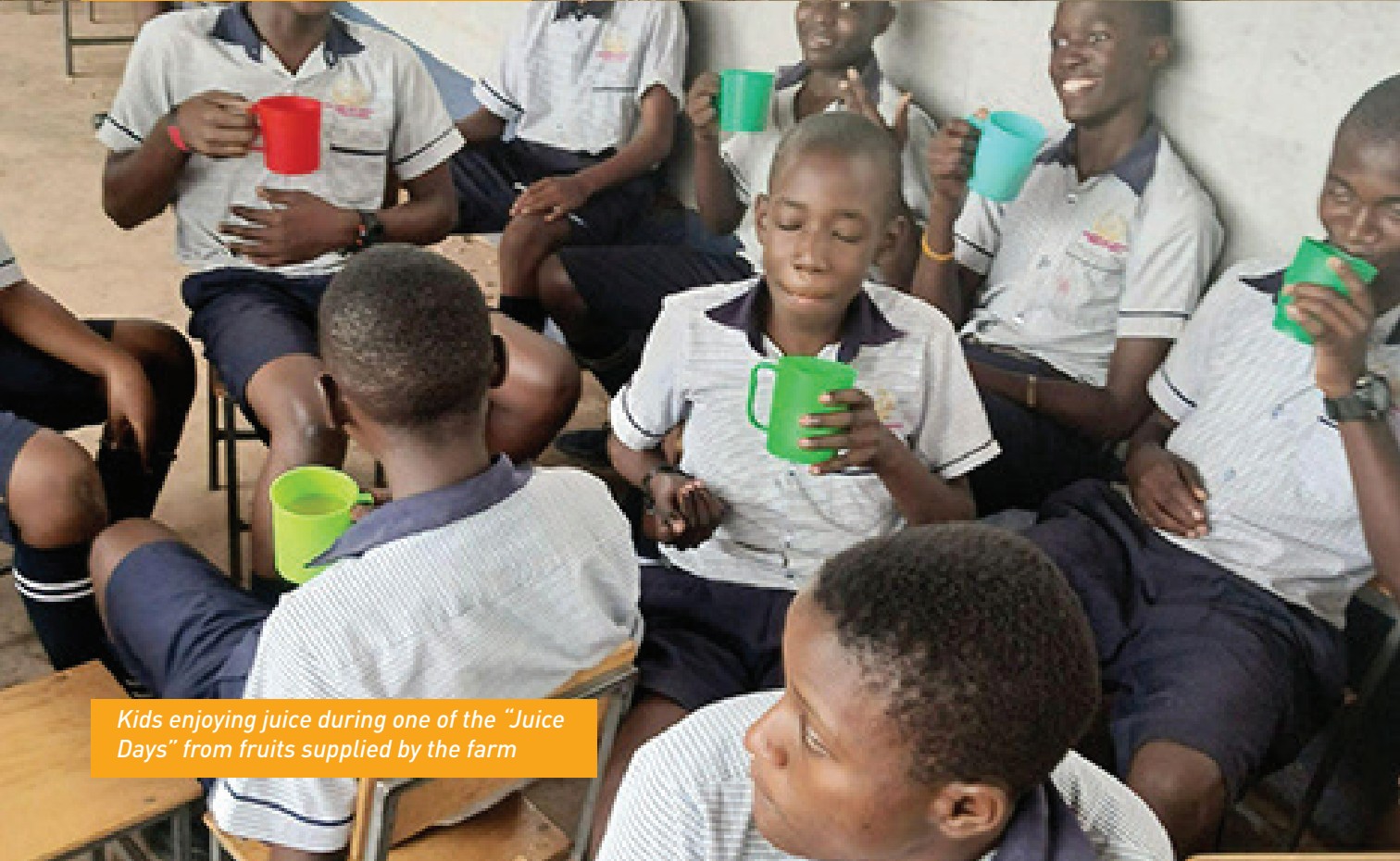
Kids enjoying juice during one of the "Juice Days" from fruits supplied by the farm