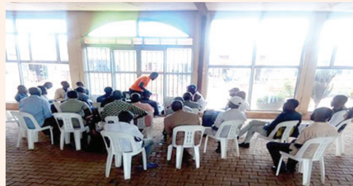
Clients attending a soap making seminar at our center.