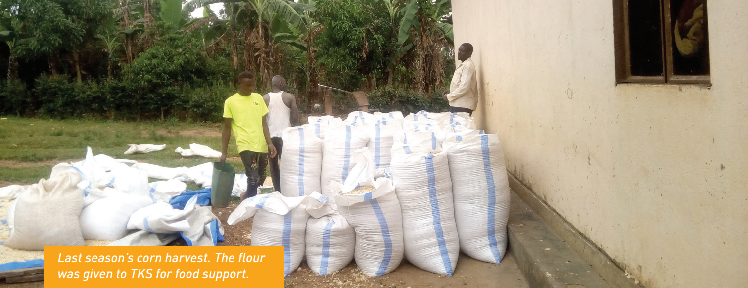
Last season's corn harvest. The flour was given to TKS for food support.