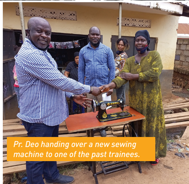
Pr. Deo handing over a new sewing machine to one of the past trainees.

train 10 fresh trainee women from the Kosovo community. These will undergo 8 months of tailoring skills training till February 20, 2023, when they will be passed out.