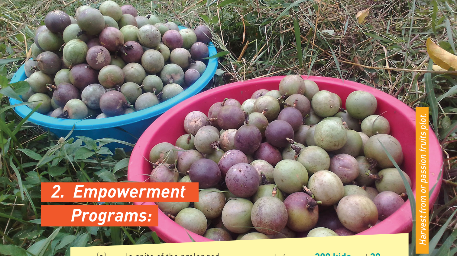
Harvest from or passion fruits plot.